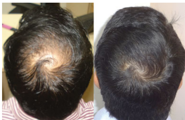
Fig. 11 Results of using topical minoxidil and oral finasteride.

in the transplanted and surrounding areas. Improvement of these hairs not only stabilizes hair loss progression but also augments hair transplant outcomes. This approach goes a long way in optimizing donor supply over patient's lifetime and increasing the interval between two transplants. 9,10,60,61 When planning a transplant, it is important to put these considerations across to the patient and emphasize the benefits of a holistic approach (→Fig. 12).