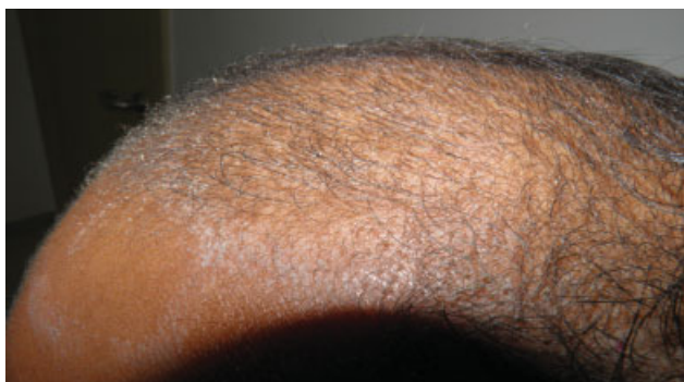
Fig. 5 Irritant dermatitis caused by minoxidil application.

It is extremely rare for patients to complain about hypotension, but some patients may complain about palpitations, irritation or burning of eyes, weight gain, etc. 35 Although it qualifies as an OTC product, topical minoxidil can have an impact on the cardiovascular system. 35 This may become significant in patients with cardiac compromise. Cardiologists'/physicians' opinion regarding safety of starting topical minoxidil in such patients is important. Although not com-