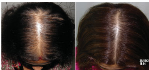
Fig. 2 Results of minoxidil in pattern hair loss (PHL).

endoperoxide synthase, upregulating the b-catenin pathway, decreased catagen by inhibiting TGF \beta -induced apoptosis of hair matrix cells, activating ERK and aKt pathways as well as activating adenosine 1 and 2 receptors in DPCs; finally, it may also play a role suppressing androgen receptor (AR)-related functions ( \rightarrow Fig. 1). 22,24–28