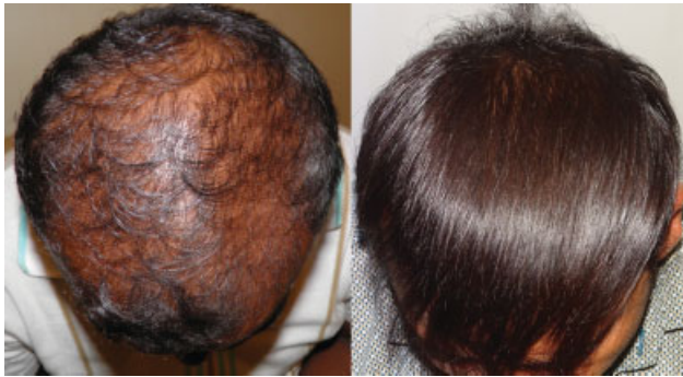
Fig. 14 Improved scalp coverage with topical finasteride and minoxidil.

lower with topical finasteride. 104 So, in effect an equal therapeutic benefit was achieved without increasing the systemic exposure to finasteride; therefore, potentially minimizing the incidence of adverse effects. The benefits in terms of hair growth are comparable to oral finasteride (→Figs. 13, 14, 15). 102,103,105