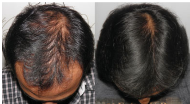
Fig. 9 Results of using topical minoxidil and oral finasteride.

The authors have routinely used a combination of topical minoxidil and oral finasteride as an adjunct to hair transplant surgery to tackle the dynamic and static aspects of MPHL. When used preoperatively (at least 12–16 weeks), it helps to improve yield by prolonging anagen and also helps to reduce postoperative telogen effluvium. When used postoperatively, medications help to improve the vellus hair present