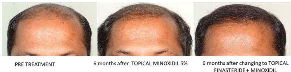
Fig. 15 Improvement with minoxidil and later with minoxidil and finasteride combination

Cyproterone acetate (CA) is an AR blocker and potent progesterone derivative that prevents dihydroxytestosterone from binding to the AR and inhibits release of follicle-stimulating hormone (FSH) and luteinizing hormone (LH), thereby reducing testosterone levels. 1,4,54 CA is not approved in the United States. It is available combined with ethinyl estradiol as an oral contraceptive in many countries (2 mg CA with ethinyl estradiol 0.035 mg) and started on day 1 of the menses for 21 days, followed by a break of 7 days. Studies have shown statistically significant improvement in hair