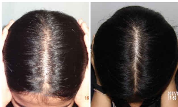
Fig. 3 Results of minoxidil in pattern hair loss (PHL).

Application of minoxidil causes anagen prolongation, delays catagen progression, and shortens telogen. 22,26,29