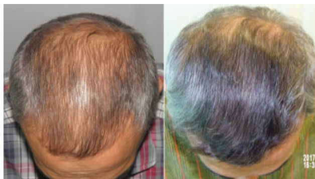
Fig. 10 Results of using topical minoxidil and oral finasteride.