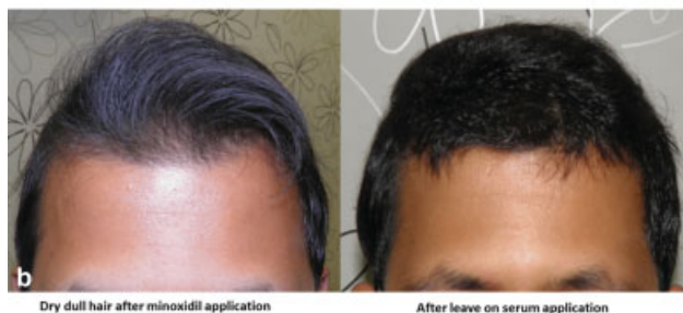
Fig. 8 (a) Dull look after minoxidil application. (b) Addressing dull look after minoxidil application with leave on serum.