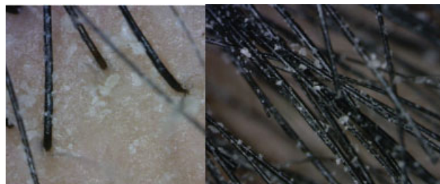
Fig. 7 Minoxidil crystal precipitation on hair