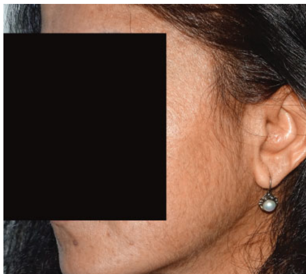
Fig. 6 Increase in facial hair after minoxidil application.