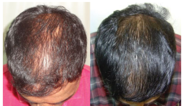
Fig. 4 Results of minoxidil in pattern hair loss (PHL).

All these actions translate into improved hair growth. Shortening of telogen results in increased shedding after initiating treatment. This is seen within a week of starting minoxidil and may last a few weeks. The benefits are objectively noticeable between 6 to 12 months after starting therapy ( \rightarrow Figs. 2, 3, 4).