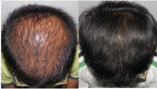
Fig. 13 Improved scalp coverage with topical finasteride and minoxidil.