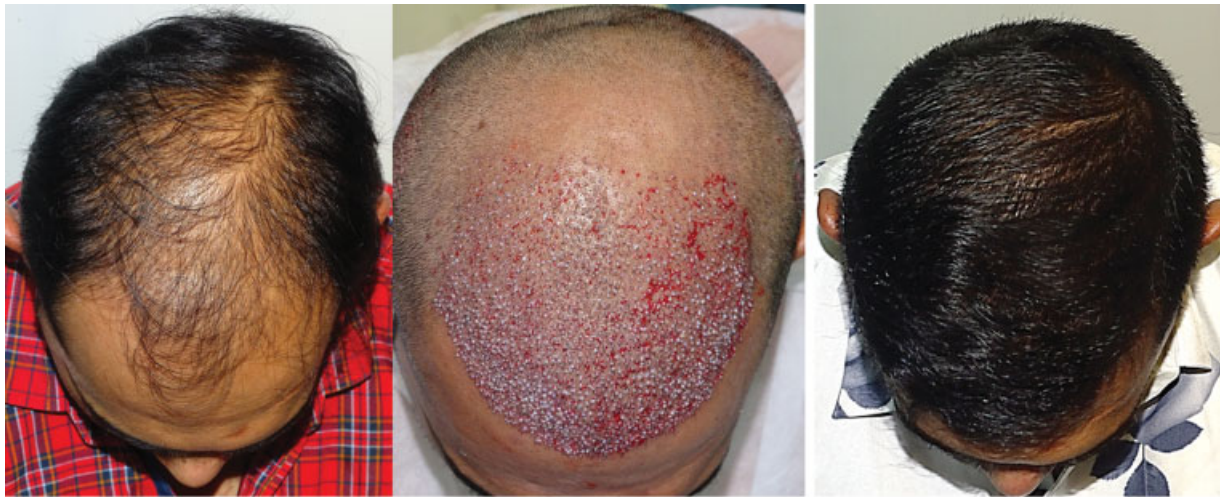
Results showing improved scalp coverage after combining hair transplantation for frontal and mid-scalp with medications addressing the thinning in the vertex region